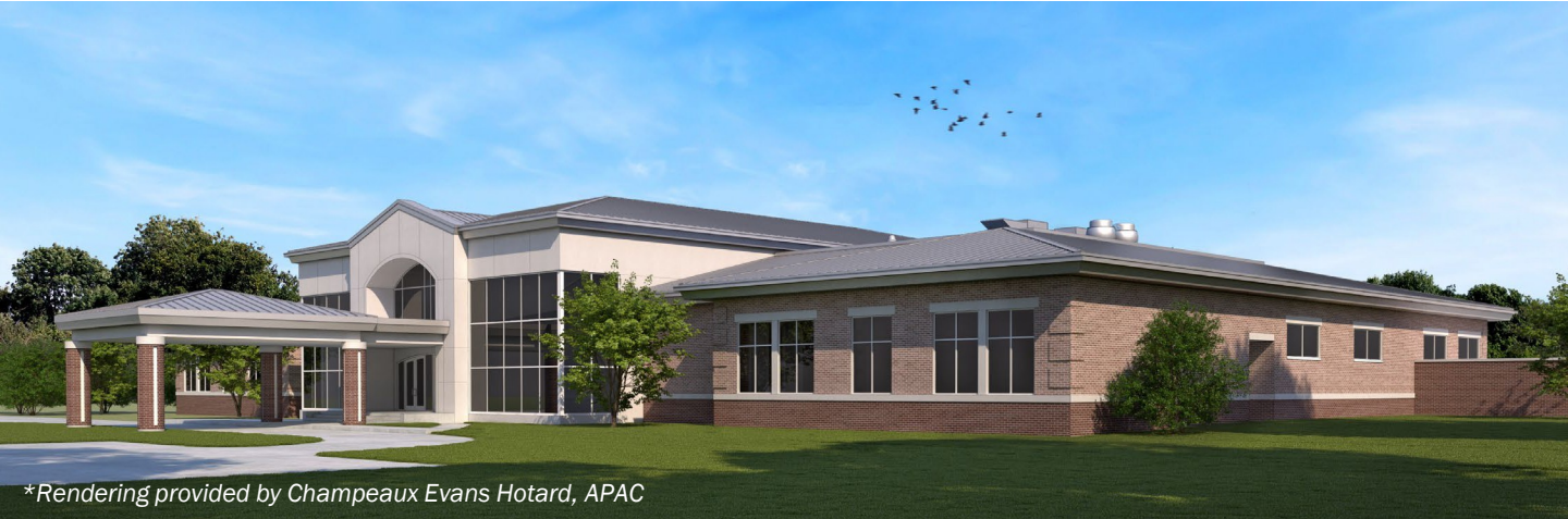
*Rendering provided by Champeaux Evans Hotard, APAC