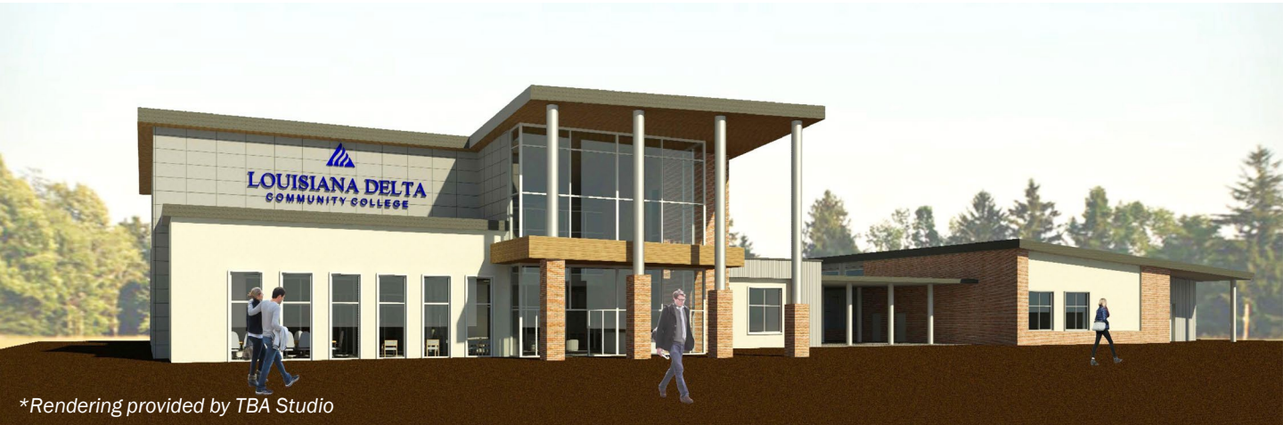
*Rendering provided by TBA Studio